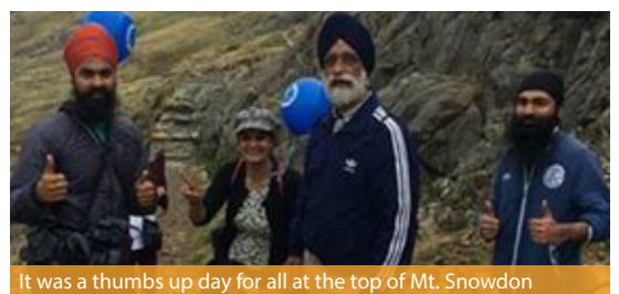
It was a thumbs up day for all at the top of Mt. Snowdon